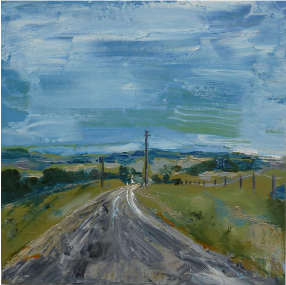
"Where Sea Meets Landscape 1" by Marianne Cara

Oil Painting - Heading South, Where the Sea Makes a Noise Series - Oil Painting on Stretched Canvas - H33.5cm x L34cm x D2cm - A$650