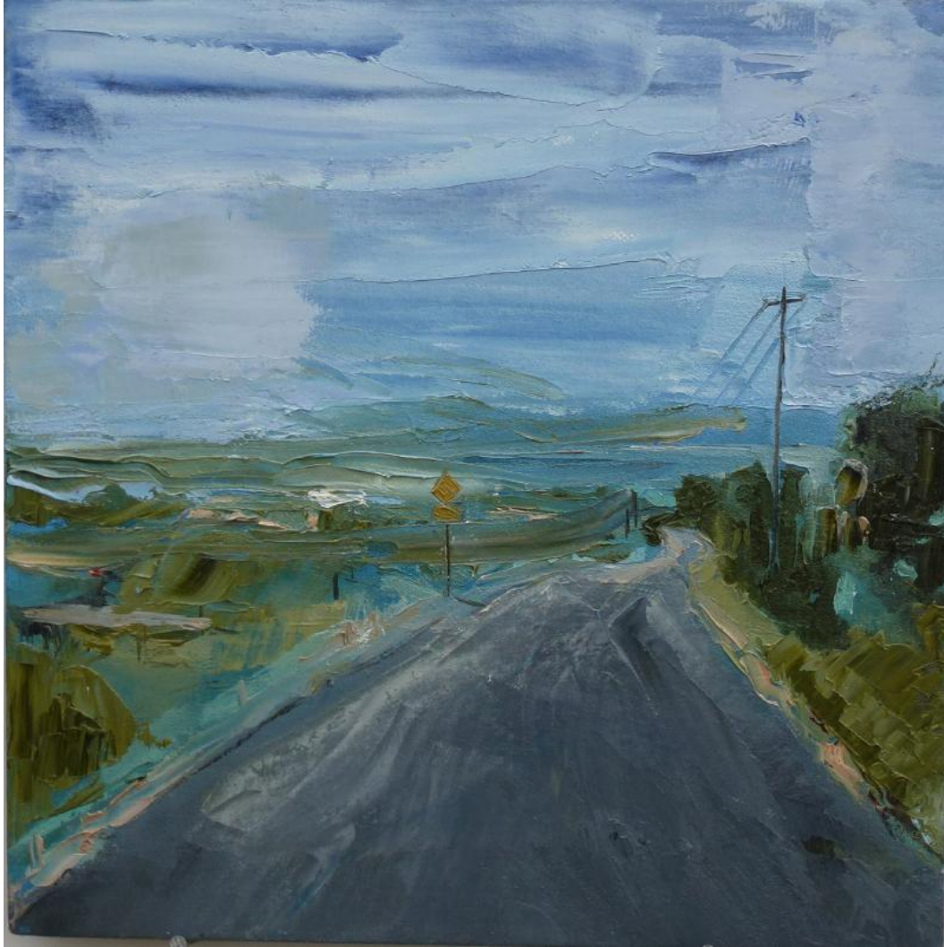
"Where Sea Meets Landscape 2" by Marianne Cara

Oil Painting - Heading South, Where the Sea Makes a Noise Series - Oil Painting on Stretched Canvas - H33.5cm x L34cm x D2cm - A$650